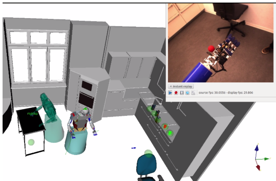
Figure 2: Plan visualization.

When the table is set, the human agent continues with the scenario. He asks the robot to arrange one chair. The robot pushes one chair to the table. Based on the reachability maps, the robot estimates a feasible position for approaching the chair. Using the whole body pushing, the chair is pushed to the target location. When executing pushing, the robot is avoiding occurring obstacles.